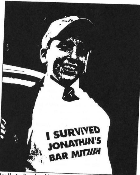
Bar/bat mitzvah t-shirts reportedly have become the latest fad.

One mother, who says the bar mitzvah receptions for her two sons were "exceptionally elaborate—more so than for our daughter, because we won't be making a wedding for our sons"—has mixed feelings about the UAHC resolution. "On the one hand, I think I feel in my gut that these receptions have gotten out of hand. On the other hand, I don't think they should be passing a resolution about this; it seems a little out of bounds. How you celebrate a bar or bat mitzvah seems pretty much a matter of individual taste."